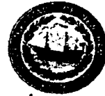
Exhibit A – 1