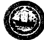
Exhibit A – 1

and Disability field and demonstrated experience and knowledge with the target population: older adults, persons with disabilities of all ages, people with intellectual, physical, and developmental disabilities, veterans and family caregivers including Medicaid/non-Medicaid recipients.