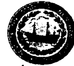
Exhibit A – 1

NWD/ADRC Person Centered Options Counseling program and CQI implementation as well as enhance and expand these protocols as they apply to OC.