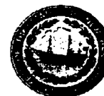
Exhibit A – 1