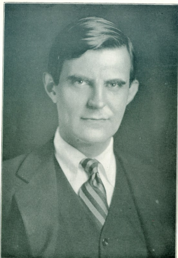
GOVERNOR JOHN G. WINANT