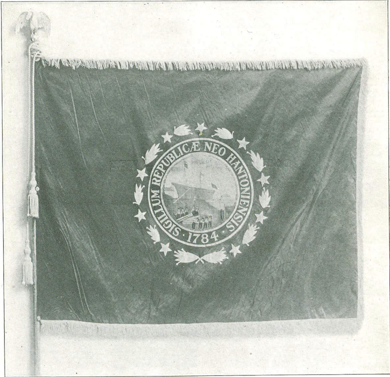
NEW HAMPSHIRE STATE FLAG