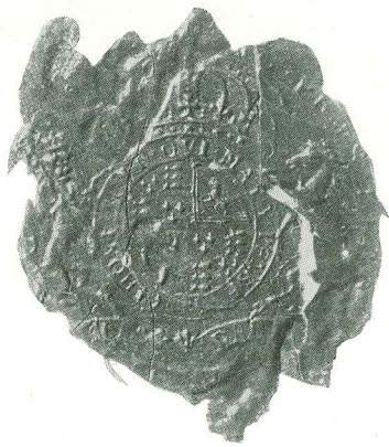
CUTT SEAL 1679/80