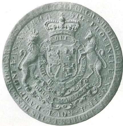
SEAL OF GEORGE III