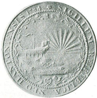
SEAL OF 1784