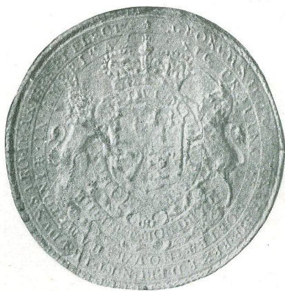
SEAL OF GEORGE II