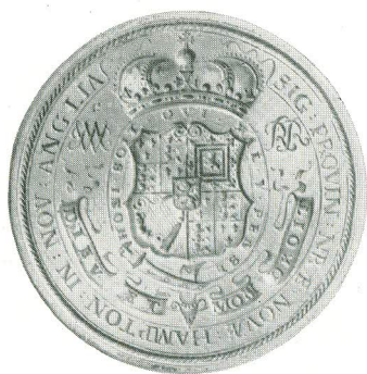
WILLIAM AND MARY 1692-1694