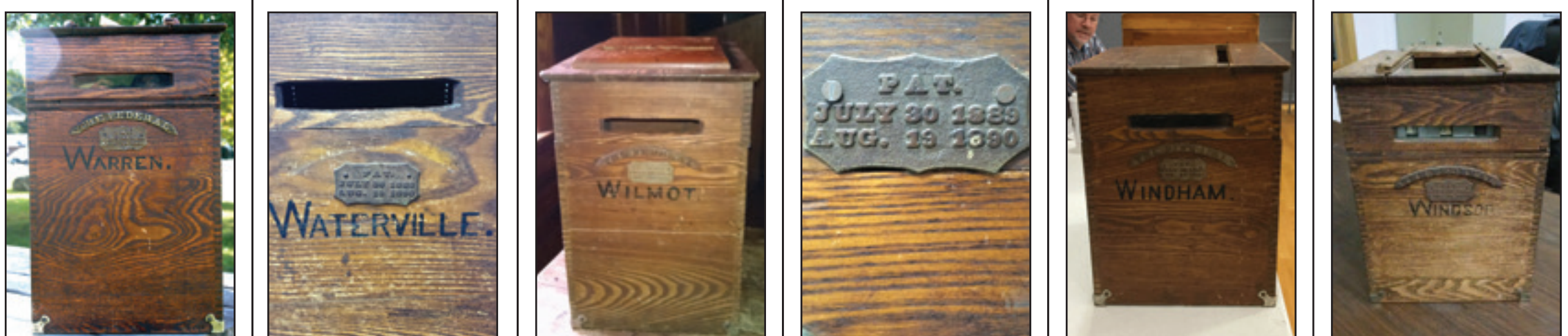
WARREN WATERVILLE VALLEY WILMOT WILTON WINDHAM