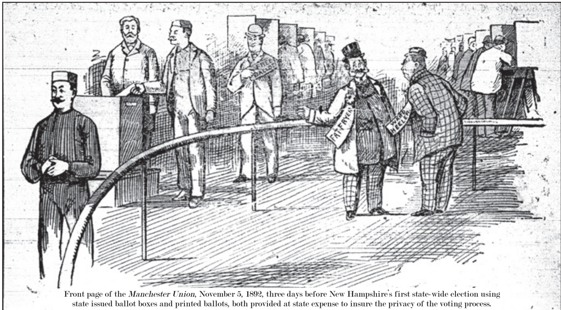
Front page of the Manchester Union , November 3, 1892, three days before New Hampshire's first state-wide election using state issued ballot boxes and printed ballots, both provided at state expense to insure the privacy of the voting process.

“Free Men at the Polls. — The Secret Ballot Puts an End to Espionage, Bossism and Intimidation”