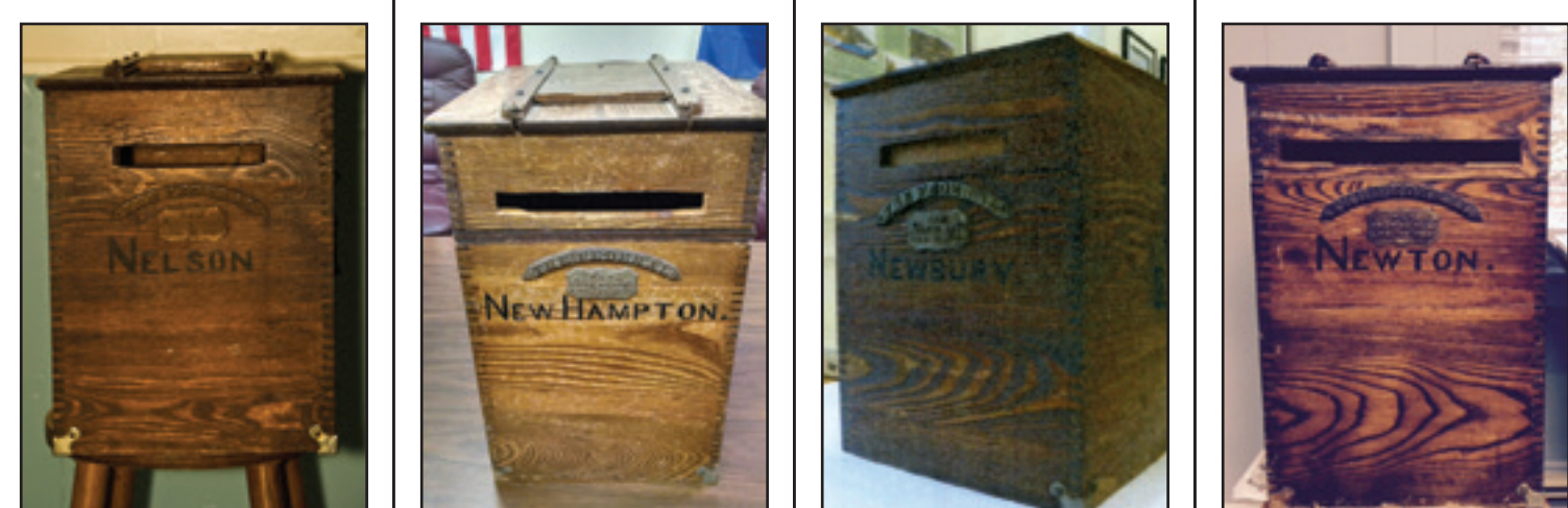
NELSON NEW HAMPTON NEWBURY NEWTON