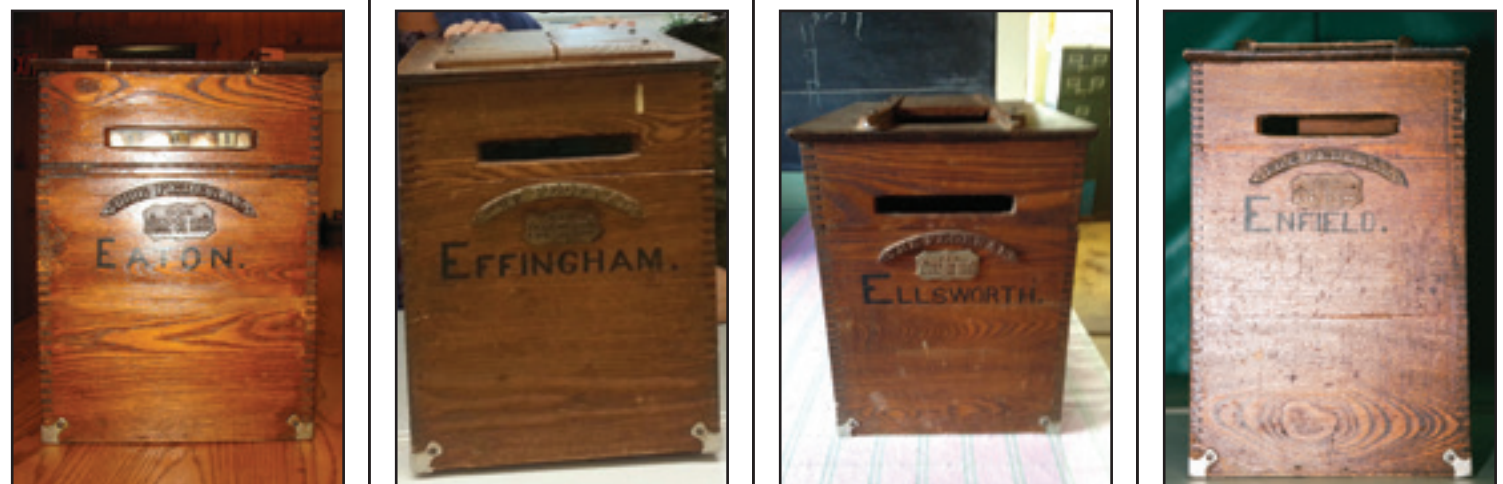
EATON EFFINGHAM ELLSWORTH ENFIELD