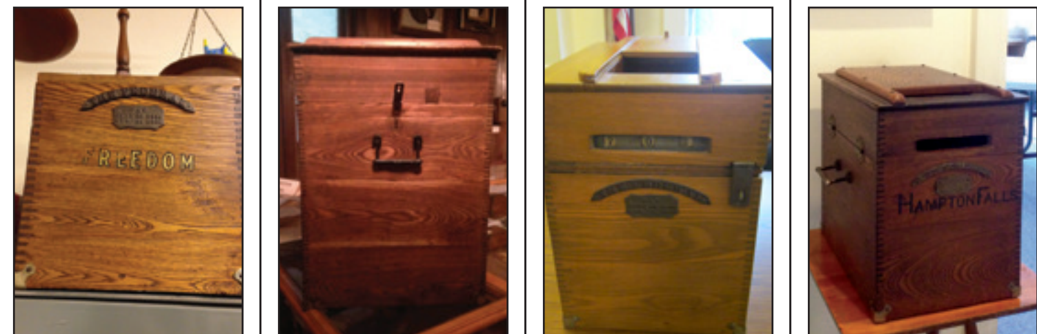
FREEDOM GILFORD GREENFIELD HAMPTON FALLS