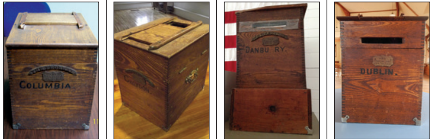
COLUMBIA CROYDON DANBURY DUBLIN