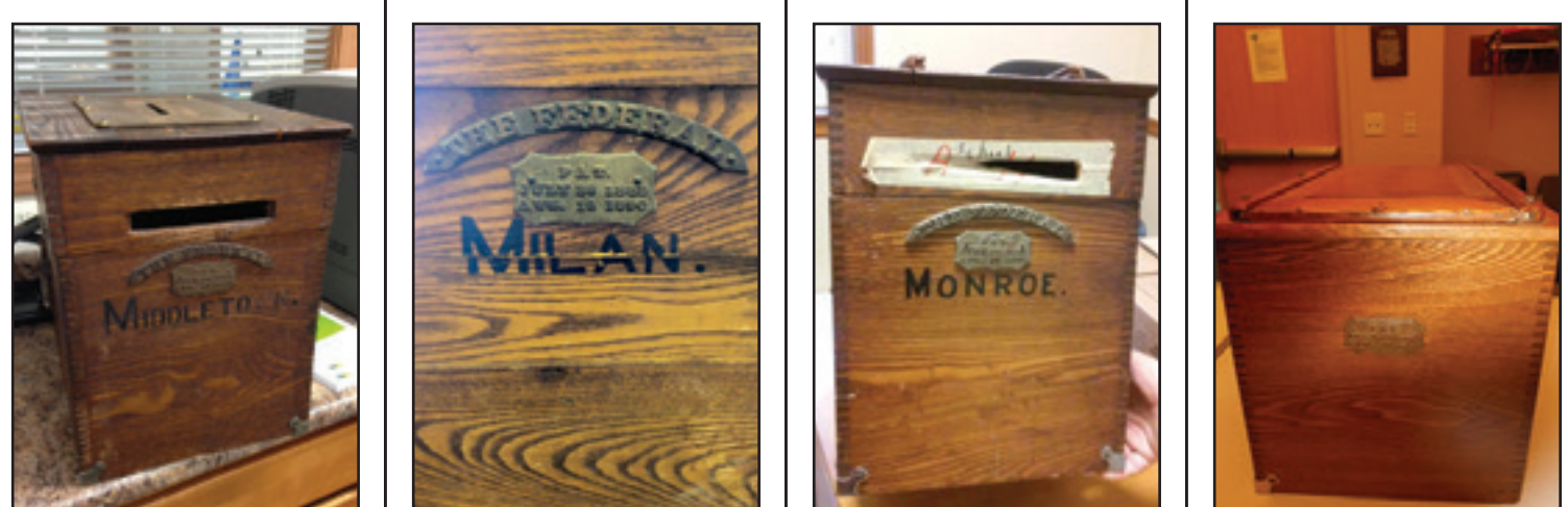
MIDDLETON MILAN MONROE MOULTONBOROUGH