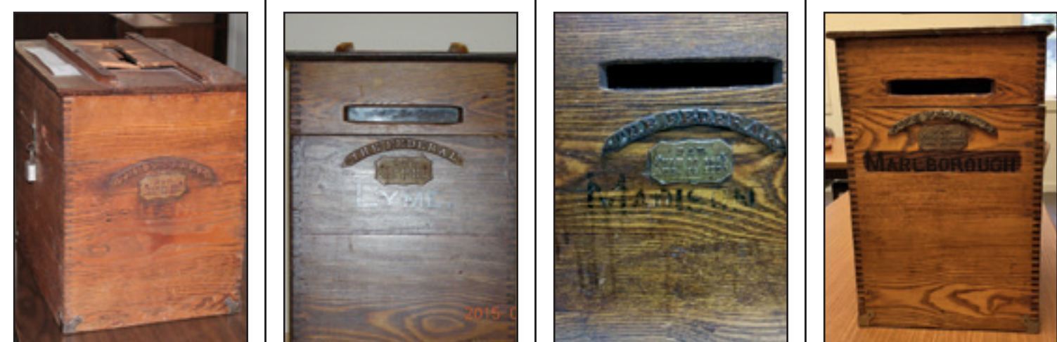
LYMAN LYME MADISON MARLBOROUGH