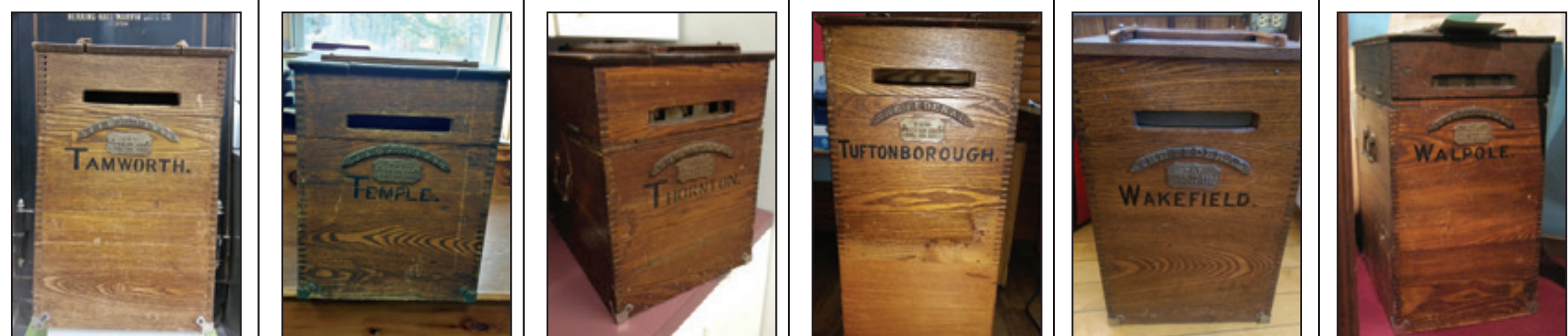
TAMWORTH TEMPLE THORNTON TUFTONBORO WAKEFIELD