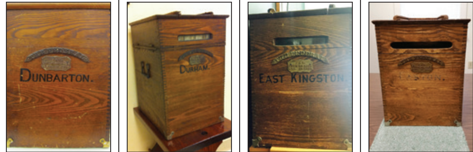
DUNBARTON DURHAM EAST KINGSTON EASTON