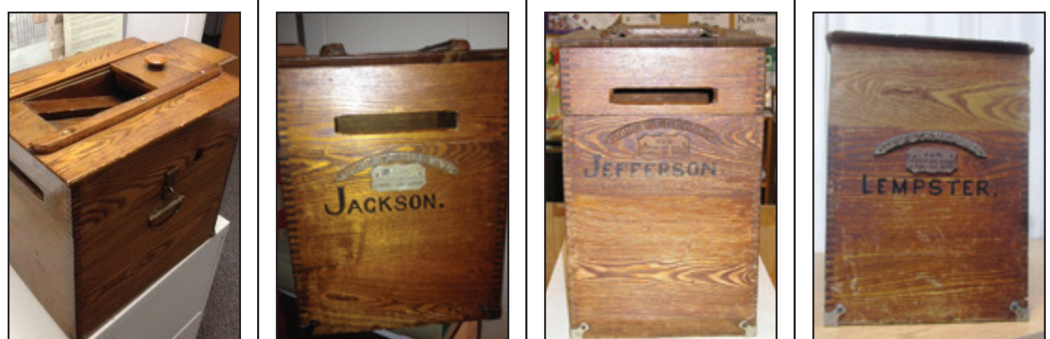
HILL JACKSON JEFFERSON LEMPSTER