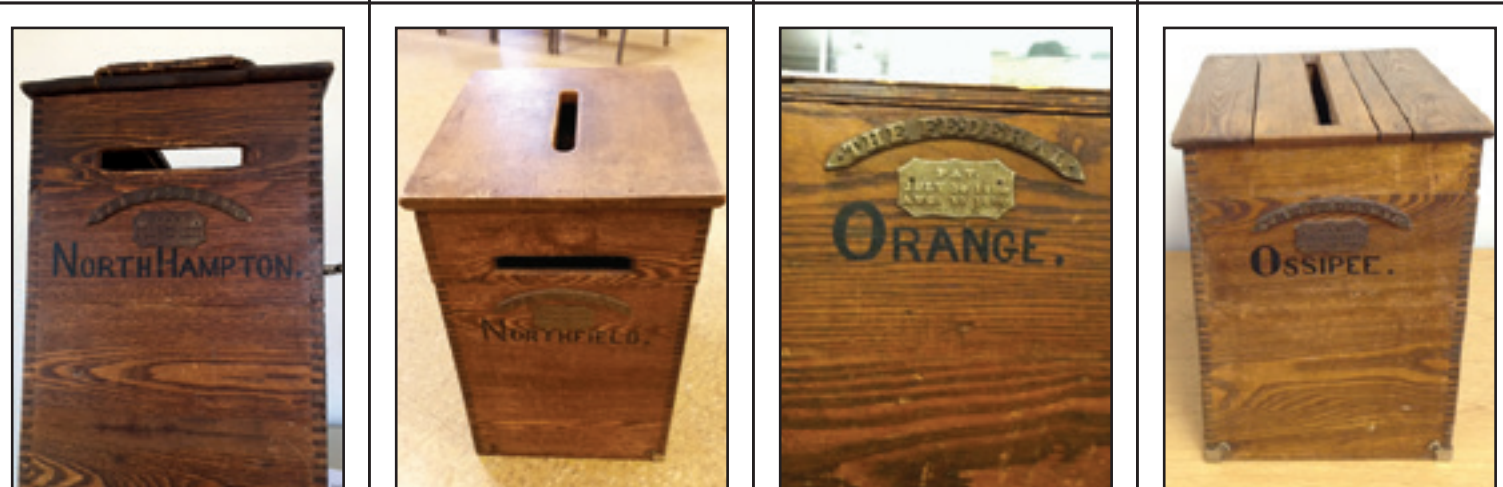
NORTH HAMPTON NORTHFIELD ORANGE OSSIPEE