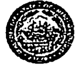
Exhibit A-1 Amendment #1

capabilities, including, but not limited to: