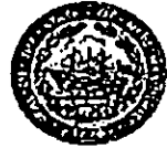
Exhibit A-1 Amendment #1