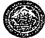
Exhibit A-1 Amendment #1