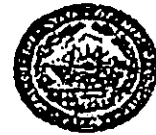
Exhibit A-1 Amendment #1

identified in sub-section 2.1., including, but not limited to: