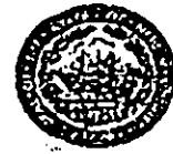
Exhibit A-1 Amendment #1

to protected health information (PHI) to which there is access in the scope of their duties as required by all state and federal regulations and laws.