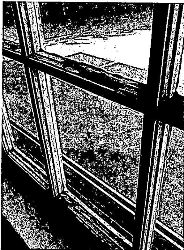
Figure 4.—Close-up view of the interior of one of the windows on the back of the building. These windows date from 1938 when this addition was added.