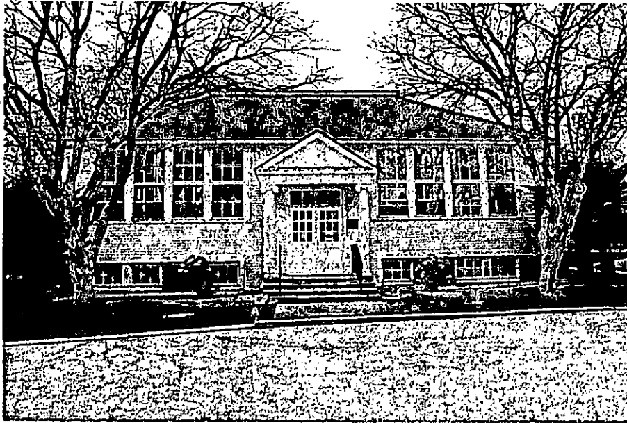
Figure 1.—Front façade of the former Stevens-Buswell School showing eight of the original large windows for the first two-room schoolhouse built in Bedford in 1921.