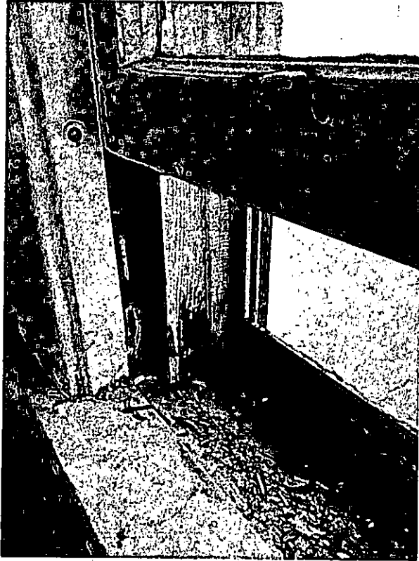
Figure 3.—Close-up view of the jamb and sill of the same front window shown in Figure 2.