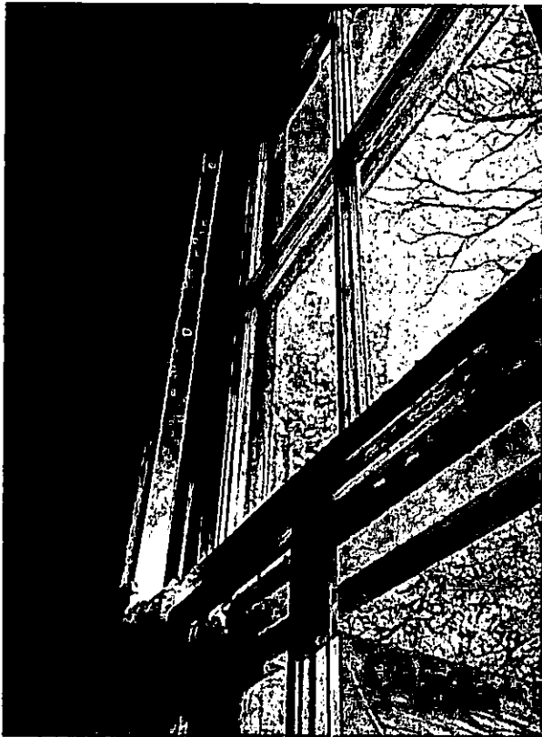
Figure 2.—Interior of one of the eight front windows of the building showing the jamb cording.