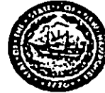
Exhibit A-1 Item D