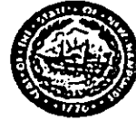
Exhibit A-1 Item D