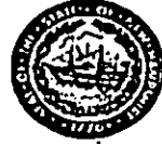
Exhibit A-1 Item D