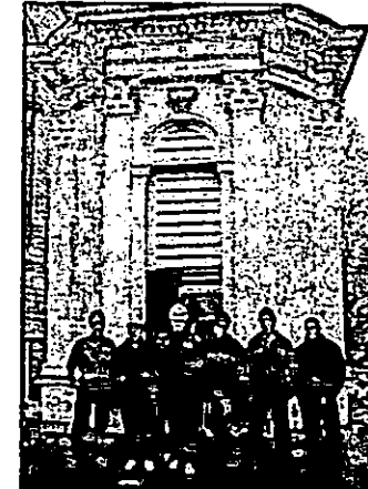
The crew of Southgate Steeplejacks