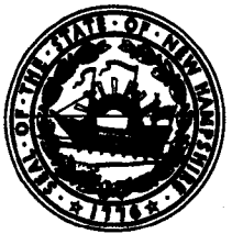
FIG 17 084