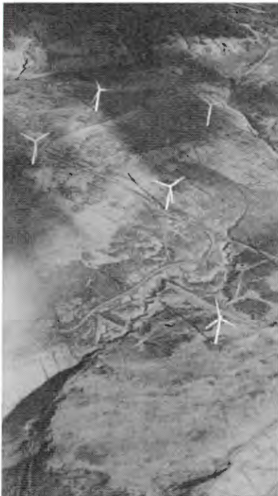
Aerial view of wind turbines Manchester, United Kingdom

The Northern Powerhouse is the UK government's vision for a super-connected, globally-competitive northern economy with a flourishing private sector and highly-skilled population ready to take its place on the world stage.