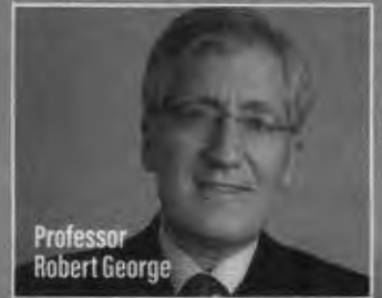
Professor Robert George