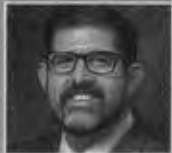
Senator Manny Diaz