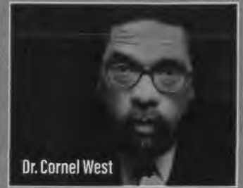
Dr. Cornel West

Author, educator and activist Dr. Cornel West and Professor Robert George, director of the James Madison Program in American Ideals and Institutions at Princeton University, hold a special keynote conversation on the value of civil discourse in society.