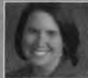
Senator Kelli Stargel