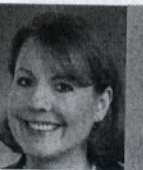
Senate Republican Whip Ann Rivers Washington