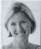
Rep. Kitty Toll Vermont