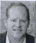
Sen. Cam Ward Alabama