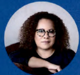
Erica Armstrong Dunbar