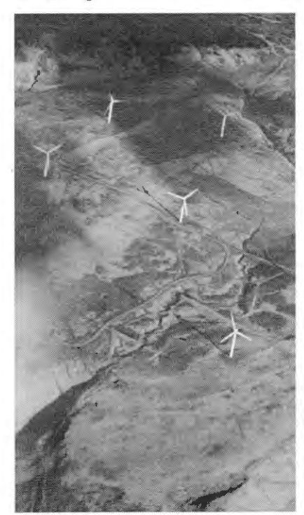
Aerial view of wind turbines Manchester, United Kingdom

The Northern Powerhouse is the UK government's vision for a superconnected, globally-competitive northern economy with a flourishing private sector and highly-skilled population ready to take its place on the world stage.